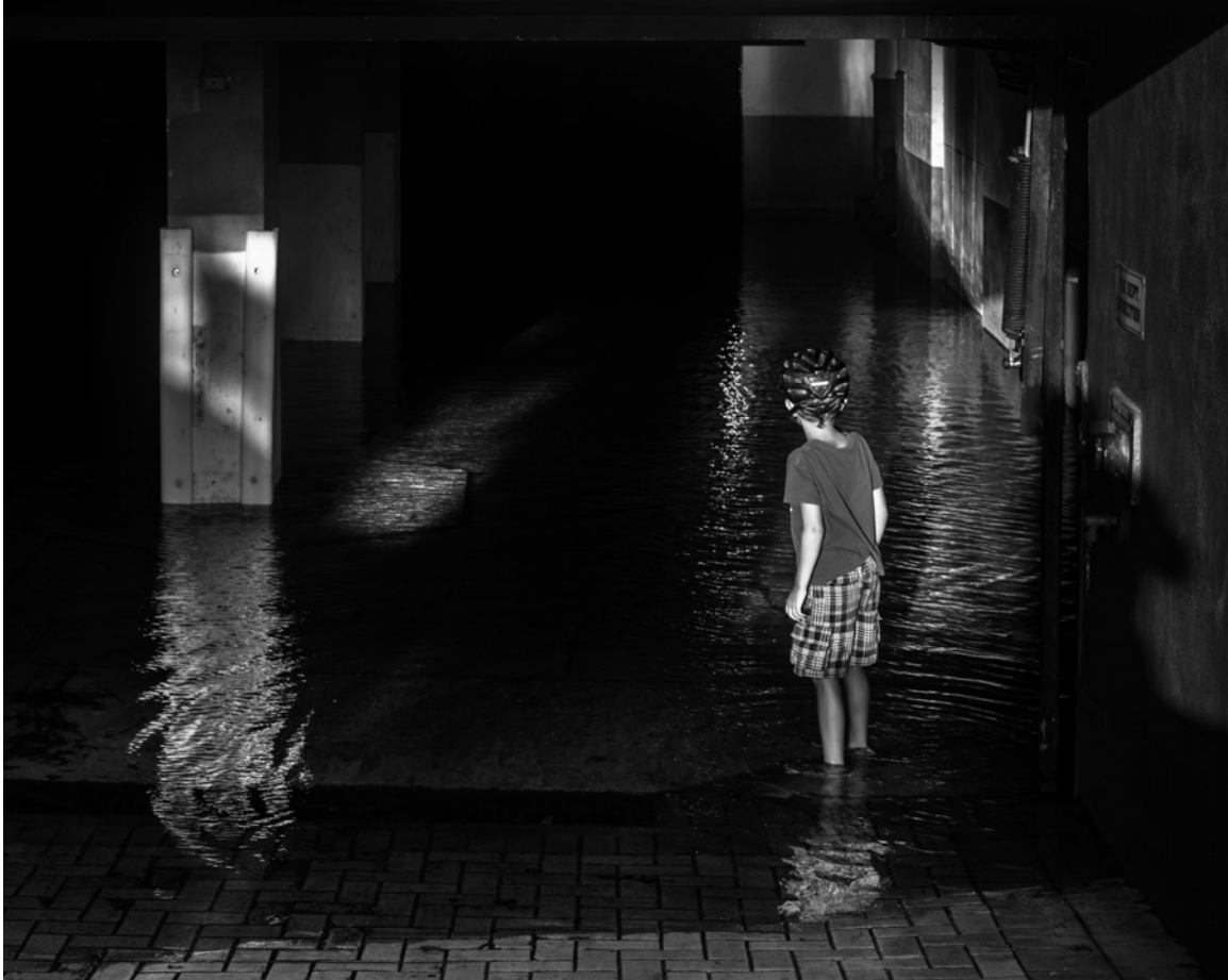
Anastasia Samoylova, Flooded Garage, 2017, from the FloodZone series

At a panel discussion for her solo exhibition FloodZone at the University of South Florida Contemporary Art Museum, Samoylova says she didn't take the hurricane seriously until hers was one of only three families in the building who hadn't evacuated. As an immigrant who left behind a cold northern climate, Samoylova was impacted by South Florida's weather and culture. Hurricane Irma marked a turning point in her work. Samoylova turned her lens on her new tropical home to produce a collection of work—also titled FloodZone —with a view of climate change and undeniable rising sea levels.