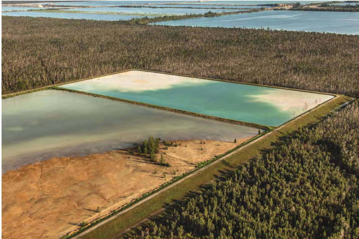
Anastasia Samoylova, Square Lake, 2018, from the FloodZone series

tourism-board-crafted paradise. In the context of the exhibition, works such as Camouflage question whether the state’s idealization contributes to its ruin in—as philosopher Timothy Morton calls it—an “act of sadistic admiration.”